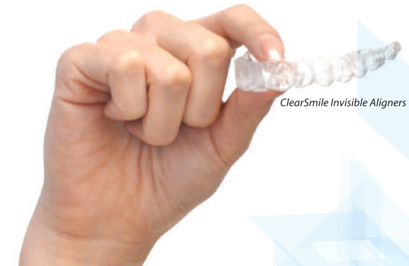
ClearSmile Invisible Aligners