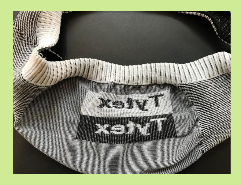
Inside View (Label Reversed)