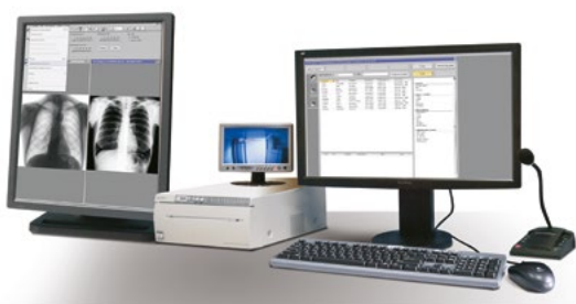
Radiologist workplace with a monochrome medical and graphical monitors