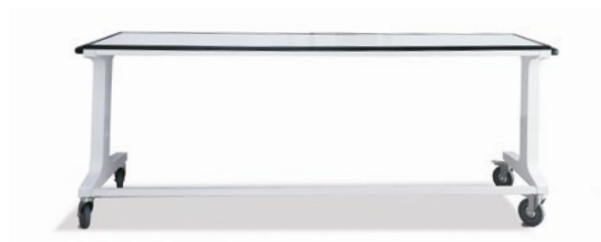
Radiolucent mobile table