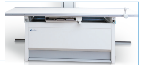
Stylis 2 Fixed Height Table