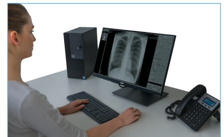
Integrated generator control and image acquisition