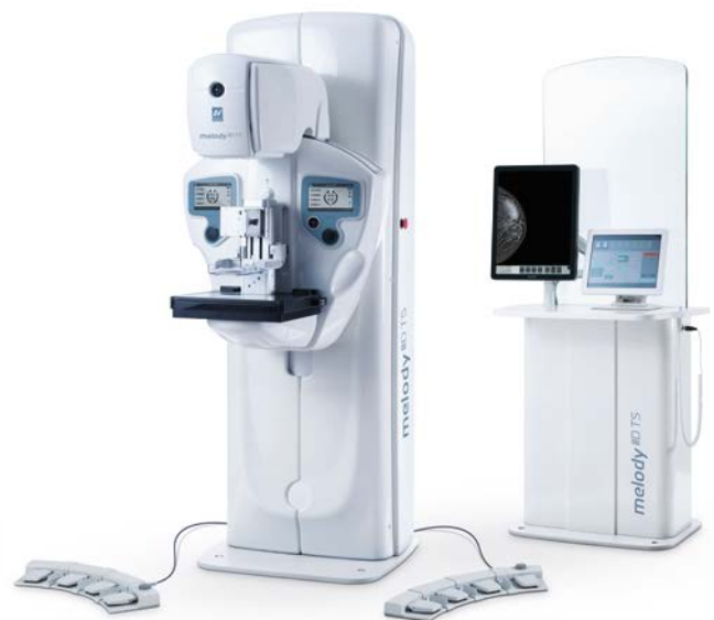
melody III DTS