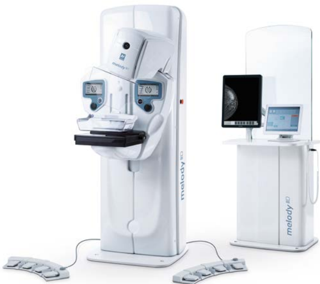
melody III D