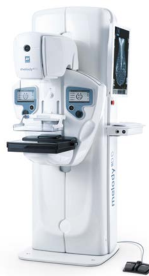
melody III DC