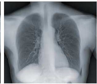
Image with Bone suppression