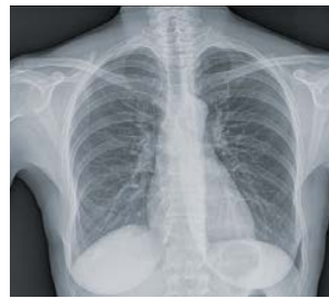
Image without Bone suppression