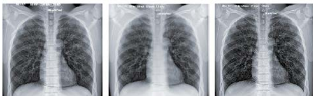
Immagine con griglia anti-diffusione

VDX Next software is an innovative application that offers advanced features and options to enhance the image acquisition capabilities of the diagnostic room such as "software grid", "boost lines" and "bone suppression".