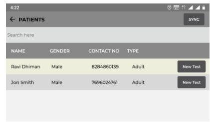
Patient Test Details