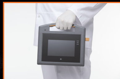
FUNCTIONALITY AND COMFORT