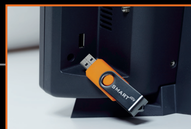
DATABASE, MANUAL AND SAFETY KEY IN ONE