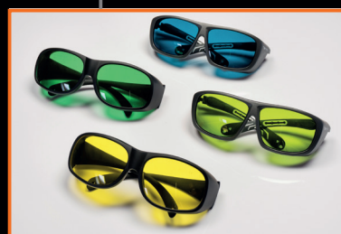
SAFE FOR DOCTOR AND PATIENT