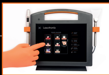
EVERYTHING AT A GLANCE