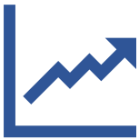
Dental Implant Fixture Market, by Price Category, Europe (USD), 2015 and 2024